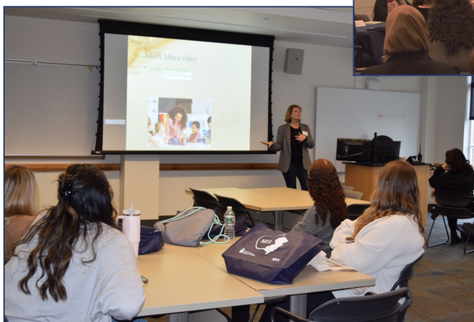
Participants thanking their breakout session presenters at the end of the conference