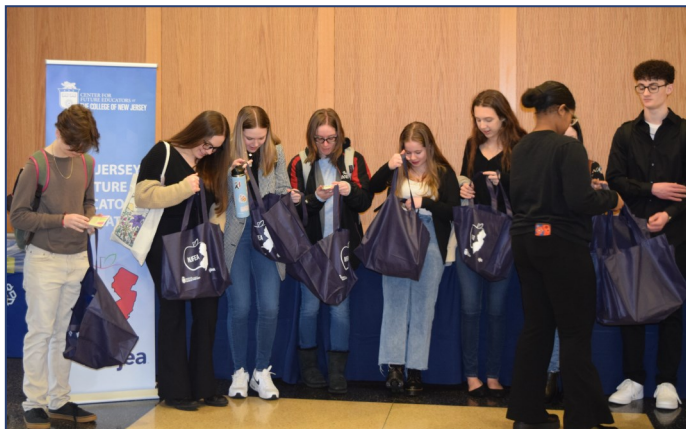
Students checking out the fun freebies in the tote bags

After the welcome and keynote speech, participants enjoyed two breakout sessions. This conference's sessions covered topics such as supporting first-generation future teachers, deaf-friendly classrooms, music education, leadership, and more. While enjoying lunch, students got to hear a panel of TCNJ preservice students share different aspects of pursuing a degree in education, and being a college student in general. Thank you to everyone who made this conference possible! We look forward to seeing both new and returning chapters at the last two conferences of the school year!